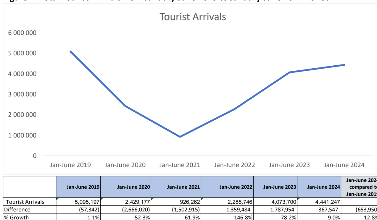
Figure 2: Total Tourist Arrivals from January-June 2019 to January-June 2024 Period

Source: Stats SA International Tourism Report. June 2024 and tourist arrivals data cuts